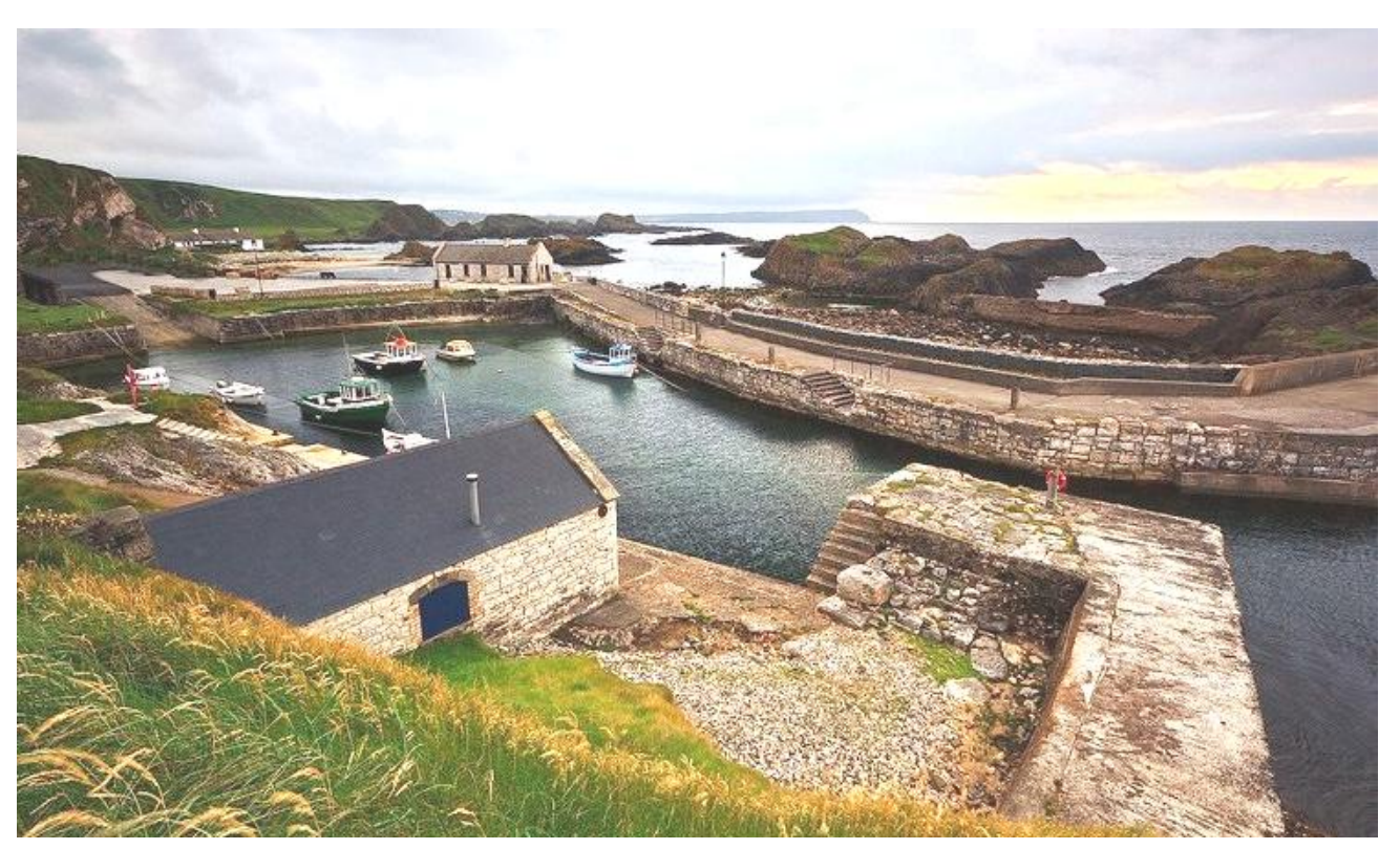
North Antrim Coast